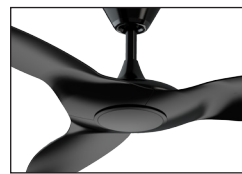
Black Finish with Smoky Lens